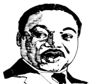
Martin Luther King, Jr.

Durante todas las Misas del próximo fin de semana, vamos a realizar el proceso de donación para la colección de regalos y promesas de la apelación de este año. Juntos podemos hacer el amor y la presencia segura de Dios son sentidas por todos, especialmente a los necesitados. Dios los bendiga por su respuesta generosa y apoyo.